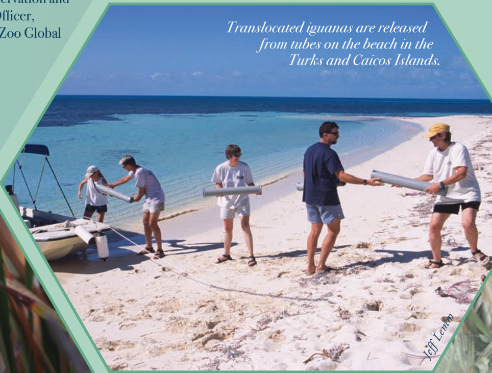
Turks and Caicos iguana

Translocated iguanas are released from tubes on the beach in the Turks and Caicos Islands.